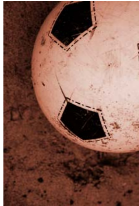
SPORTS ARE A GREAT THING TO GET INVOLVED IN!