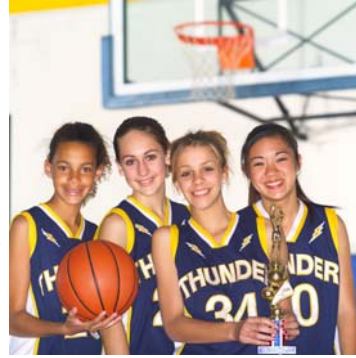
Do You Know Your Rights? You Should!

Many of our graduates that had participated in independent living classes through the agency appreciated the classes now that they looked back on them even if they didn't appreciate them then. They provided ideas for independent living classes that would have been helpful if they had been offered. They appreciated having rules in foster care now that they looked back on it, even if they