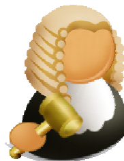
Are you working within the law?

A link to these guidelines will soon be added to the FCDSS IL web-site for easy reference.